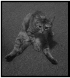
Misa Relaxing at Home

Hi, I just wanted to give you an update on how Misa is doing. We added her to our family in March and she made herself right at home.