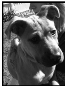
Stella at the shelter (aka Monkey)