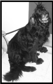
Ladybug at the shelter