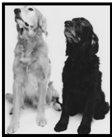
Moses and Katy (aka Ladybug)